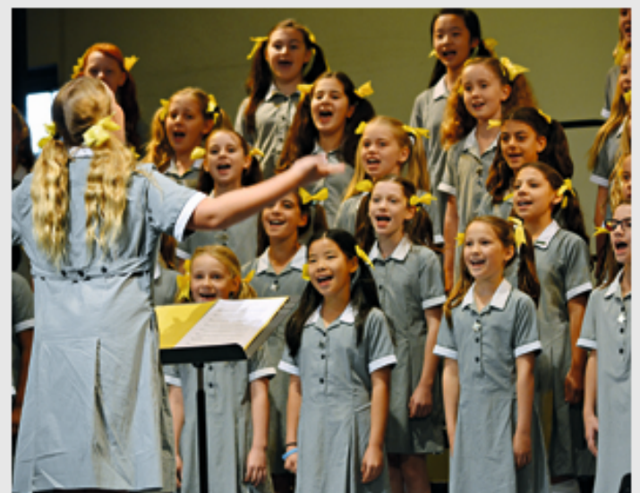
Methodist Ladies' College.