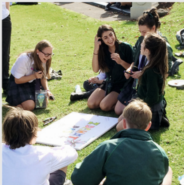
Brighton Secondary College.